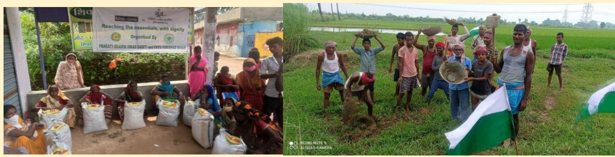
marginalized community who has lost their

crops and food grain .during water logging. After receiving food Grain From MGSA Gwalior(MP), PGVS/EP distributed Dry food kits ( 15<sup>th</sup> kg )at village place Sikarhatta in one day 10 volunteers involve in distribution.