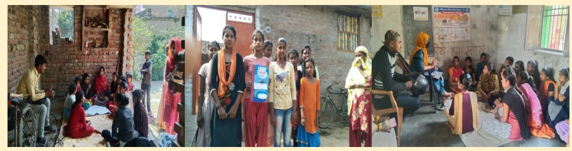
8<sup>th</sup> March 2022 (Naubatpur)