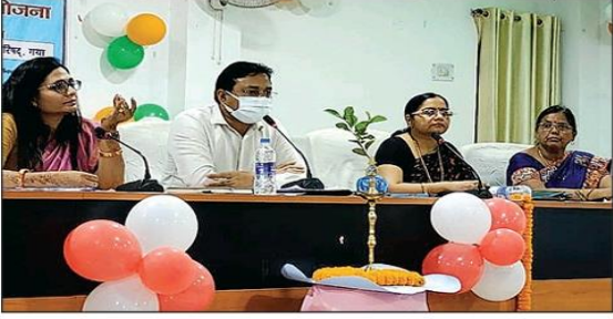
कार्यशाला में भाग लेते सदर एसडीओ व अन्य।

गया (एसएनबी)। आकांक्षी जिला कार्यक्रम नीति आयोग, गया, पोषण माह 2021 के अंतर्गत प्रखंड अभिशरन कार्य योजना पर बुधवार को एक दिवसीय कार्यशाला का आयोजन जिला परिषद् के सभागार में किया गया। कार्यक्रम का विधिवत उद्घाटन एस डी ओ गया सदर एवं डीपीओ आईसीडीएस के द्वारा संयुक्त रूप से दिप प्रज्ज्वलित