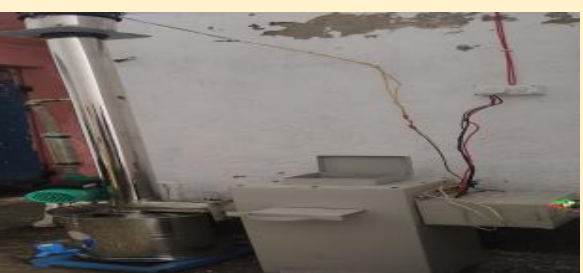
Wast disposal management